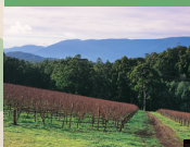
YARRA BURN WINERY