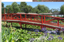
BLUE LOTUS WATER GARDEN

OTHER ATTRACTIONS: WARBURTON WATERWHEEL & RAINFOREST GALLERY