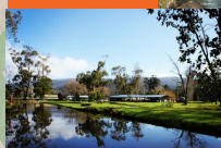
BUXTON TROUT FARM

OTHER ATTRACTIONS: MARYSVILLE MARKET, BRUNO'S ART & SCULPTURE PARK & MANY GREAT WALKING TRAILS